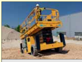
29998 - Haulotte HS15E Pro 29999 - Haulotte HS18E Pro full-electric 4x4 - Bj. 2023