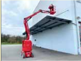
23811 - PB Dino 12Z 11,5m - Battery - year 2023