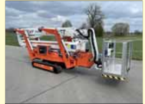
26042 - EasyLift RA31 30,2m - Batt. & Diesel - 2024