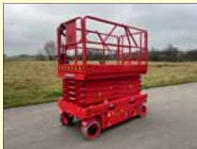
23361 - PB S100-12EL 10,00m - Battery - 2023