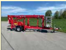
24822 - Europelift TM16TJi 16m - 230V & petrol - 2024