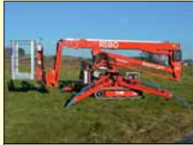
24455 - EasyLift R180 18m - 230V & petrol - 2024