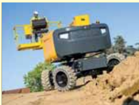
29997 - Haulotte HA 16E Pro 16m - Battery - Bj. 2024