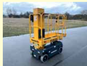
26597 - Compact Star 8S 8m - Battery - year 2022