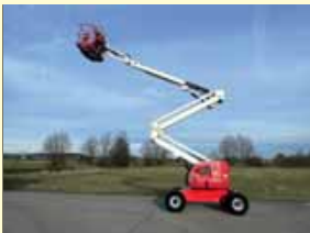
24783 - JLG 510AJ 17,8m - 4x4 Diesel - 2014