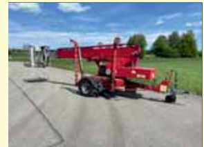
8893 - DENKA*LIFT DK18 18m - Battery - year 2013