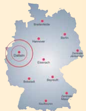
Lift-Manager service stations