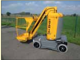
25742 - Haulotte Star10 10m - Battery - year 2024