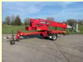
25437 - DENKA*LIFT DK25 25m - Battery - year 2002