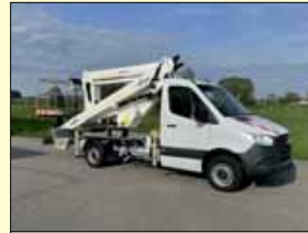
24189 - GSR B240PX 23,7m - Mercedes - 2024