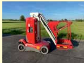
24759 - Haulotte Star10 10m - Battery - year 2013