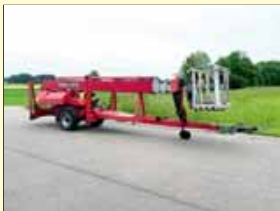
11991 - DENKA*LIFT DL30 30m - Battery - 2007