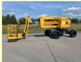
25383 - Haulotte HA16RTJ 16m - Battery - year 2023