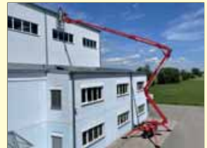
20650 - EasyLift RA24 23,5m - 230V & Diesel - 2022