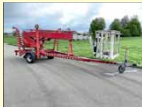
7413 - DENKA*LIFT DL18 18m - Battery - year 2006