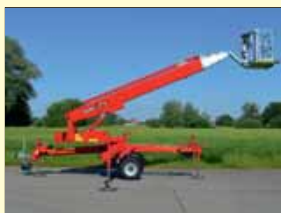
24858 - DENKA*LIFT DK25 25m - Battery - year 2024