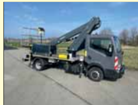
18014 - GSR B180T 18m - Nissan 52.000km - 2019