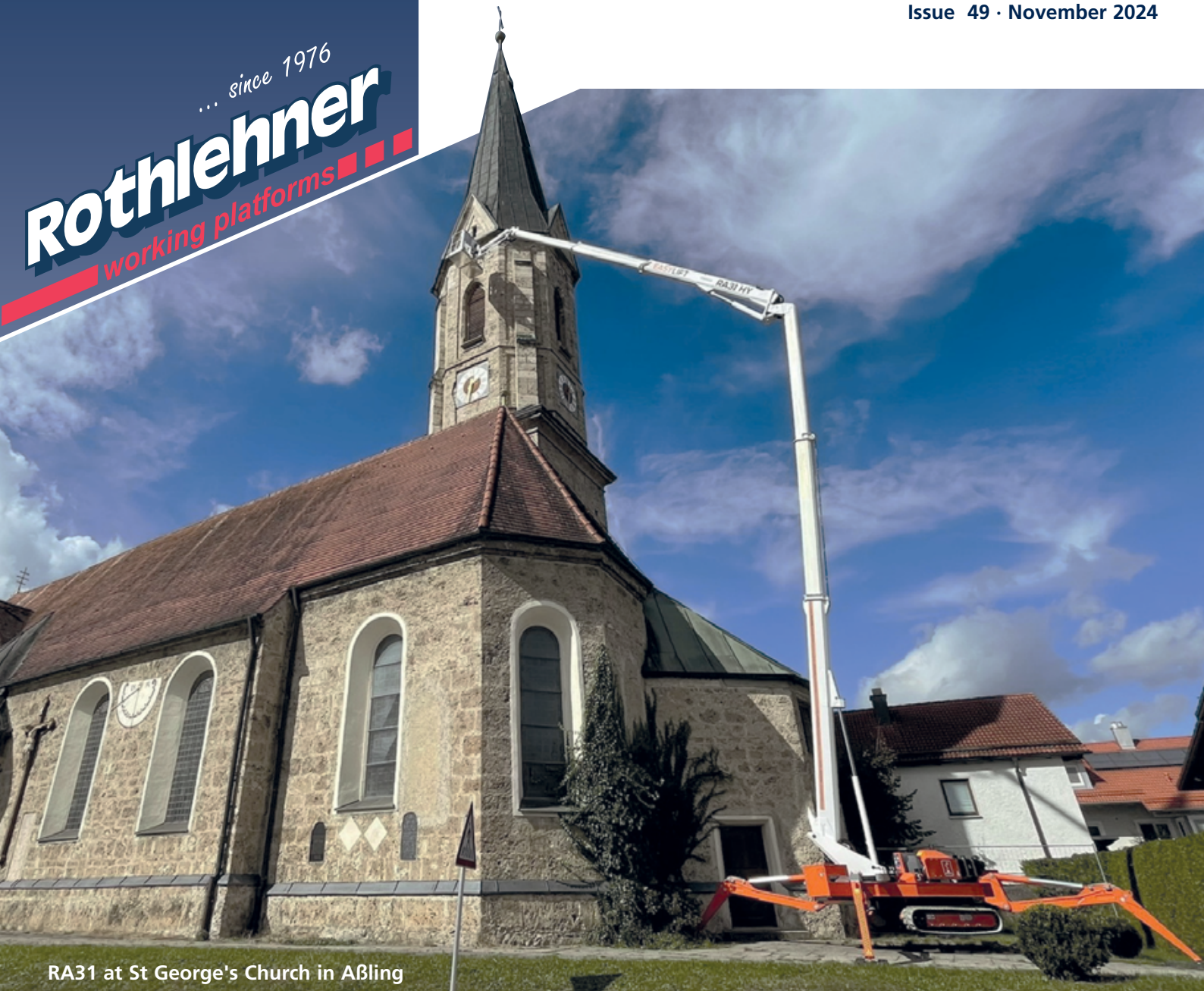
RA31 at St George's Church in Abling