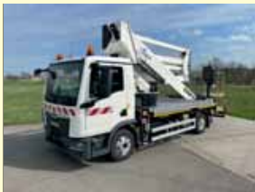
22848 - GSR E290PX 28,3m - on MAN 7.5t - 2024