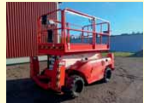
26703 - Haul. Compact 12DX 12m - Diesel 4x4 - 2015

For an offer please note machine-number on backside and send it back to us.