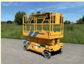
22949 - Haul. Compact 10 10m - Battery - year 2022