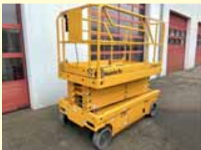
26588 - Haul. Compact 12 12m - Battery - year 2022