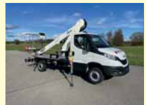
23788 - GSR B200T 20m - Mercedes - year 2024