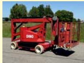
3525 - PB Dino 1210 12m - Battery - year 2002