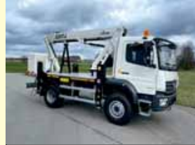
23135 - GSR B220TJ 22m - Diesel - year 2024