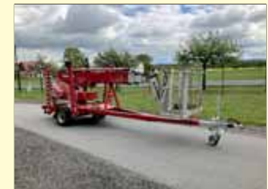
7413 - DENKA DL18 18m - Battery - year 2006