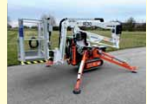
25774 - Easylift R130 13m - 230V&Petrol -Bj.2024