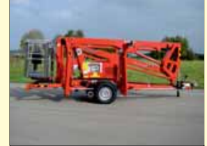
26056 - Europelift TM16GT 15,8 - 230V & Petrol - 2023