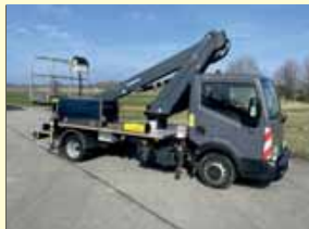
18014 - GSR B180T 17,7m - Nissan 50k km - 2024