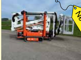
21838 - Easylift RA15 15m -230V&Petrol- year '24

If interested, please mark devices in checkboxes and return to us with the "send" button on page 2