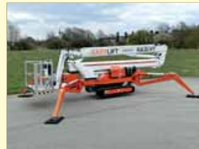
26042 - Easylift RA 31 31m - Battery & Diesel - '24