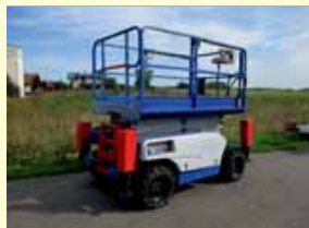
24387 - Haul. Compact 12DX 12m - Diesel 4x4 - 2007