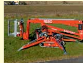
26174 - EasyLift R180 18m -230V & Petrol - 2023