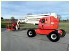
24783 - JLG 510AJ 17,8m - 4x4 Diesel - year '14