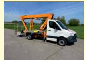
19883 - GSR B220TJ 22m - MB 15k km - year '21