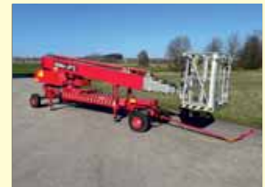
3201 - DENKA DL28N Narrow 28m - Battery - year 2001