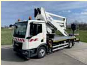
22848 - GSR E290PX 28,2m - MAN TGL - year '24