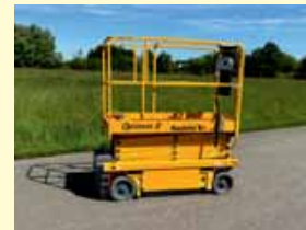
26033 - Haul. Optimum 8 8m - Battery - year 2021