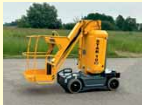
25101 - Haulotte Star10 10m - Battery - year 2021