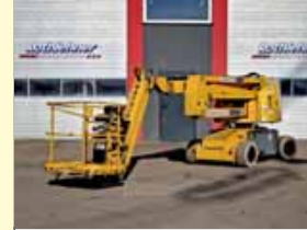
8672 - Haulotte HA15IP 15m - Battery - year 2005