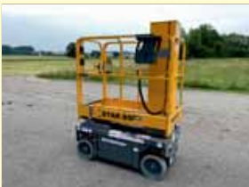
22741 - Haulotte Star 8S 7,95m - Battery - year 2021