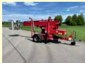
8893 - DENKA Dk18 18m - Battery - Bj. 2013