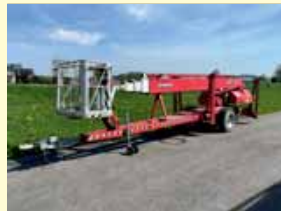
11991 - DENKA DL30 30m - Battery - year 2007