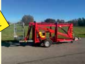
23850 - Europelift TM13G Eco 13m -230V&Petrol - Bj. 2024