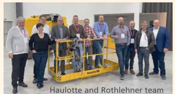
Haulotte and Rothlehner team