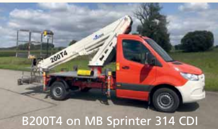
B200T4 on MB Sprinter 314 CDI

Following the successful launch of the new articulated telescopic superstructures on 3.5 t (we reported on this in Issue 40), GSR then presented their new telescopic aerial work platforms in the second half of the year.