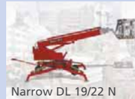
Narrow DL 19/22 N