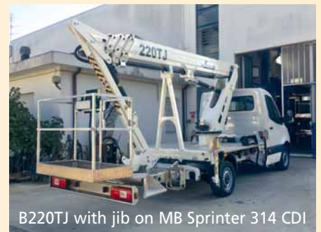
B220TJ with jib on MB Sprinter 314 CDI

The B220TJ with an articulated jib and approx. 22 m working height originates from the same construction set. This machine has a special feature with its extra-long jib .