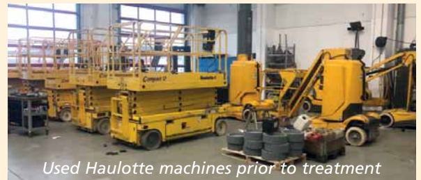
Used Haulotte machines prior to treatment

Special customer colours, such as in the image on the left which was painted in Massing, have been part of our daily business for many years.