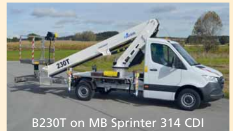
B230T on MB Sprinter 314 CDI

Ranking above this is the new B230T with around 23 m working height and approximately 14 m horizontal reach.