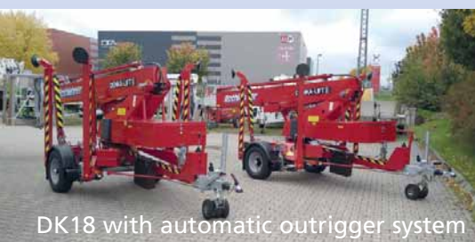
DK18 with automatic outrigger system

Two DK18s went to ČEPS as , the power grid operator in the Czech Republic.