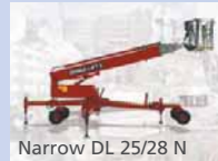
Narrow DL 25/28 N