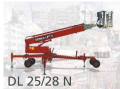
DL 25/28 N