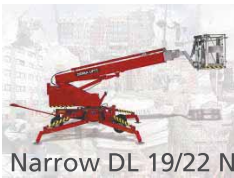
Narrow DL 19/22 N