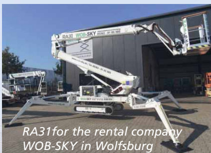
RA31 for the rental company WOB-SKY in Wolfsburg

Two EASYLIFT RA31 were recently delivered to North Rhine-Westphalia.