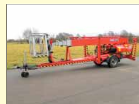
18565 - DENKA DL25 25m - Battery & Diesel - 2006