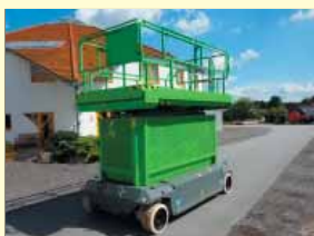
7811 - PB S171-16E 17,10m - Battery - year 2007