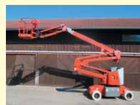
18932 - Haulotte HA15IP 15m - Battery - various years