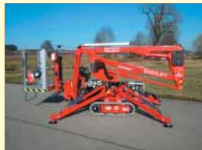
20815 - Easylift R130 12,2m - 230V & Honda - 2021

... since 1976 Rothlehner working platforms