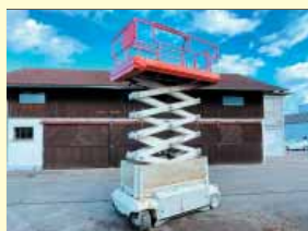
10614 - PB S151-16 E 15m - Battery - year 2014