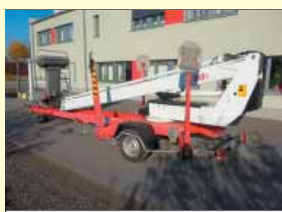
21320 - Dino Lift 180T 18m - 230V - year 2007