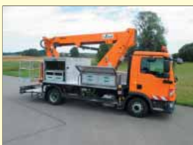
11488 - GSR E180TJ 18m - MAN TGL - year 2015