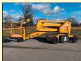
18402 - Haulotte HA 15 I 15m - Battery - year 1999