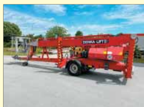
12855 - DENKA DL30 30m - Battery & Diesel - 2018