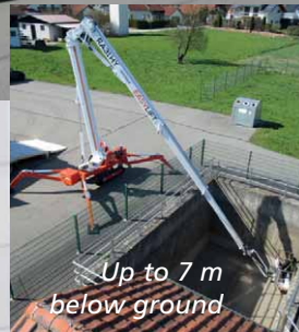
Up to 7 m below ground