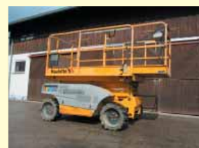
20420 - Compact 10DX 10,3m - 4x4 Diesel - year 08