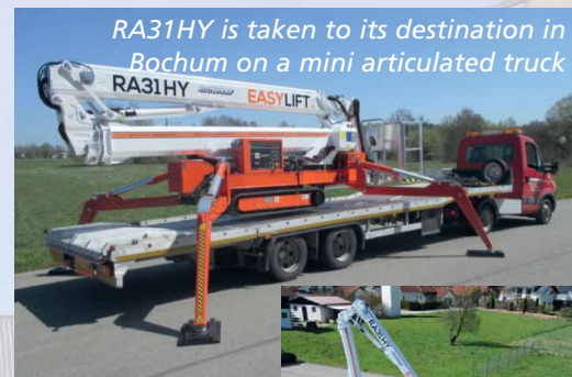
RA31HY is taken to its destination in Bochum on a mini articulated truck

From tree cutting in impassable terrain to glass cleaning in indoor areas, this machine is extremely versatile thanks to its adjustable chassis, the radio remote control and variable automatic-levelling.