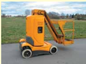
19846 - Haulotte Star10 10m - Battery - various years