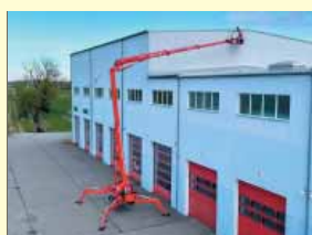
20747 - Easylift RA 31 31m - 230V & Diesel - 2021