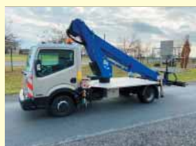
12615 - GSR B230T 22,5m - Nissan Cabstar - 2016