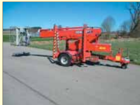
1065 - DENKA DK7 MK21 21m - Hybrid - year 2002