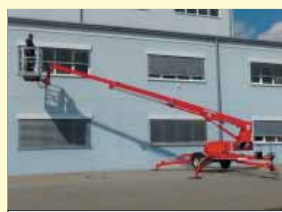
20964 - Europelift TM13T 13m - 230V & Honda - 2021