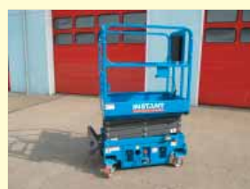
20470 - Instant IX1330 6m - Push Around - 2021