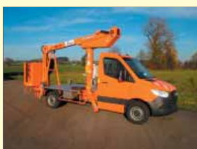
19036 - GSR E140TJV 13,6m - MB 314 - year 2021