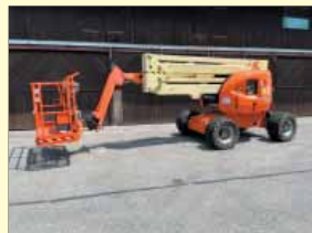
20660 - JLG 450 AJ 15,7m - 4x4 Diesel - 2008