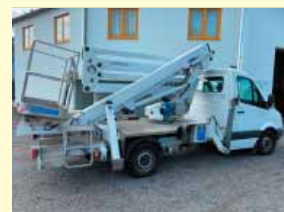
20170 - CTE Z 20 19,8m - MB 311 CDI - 2007