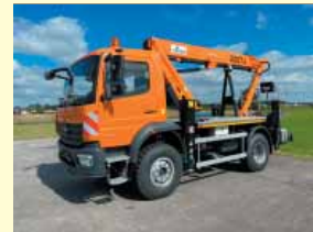
19330 - GSR B220TJ 22m - MB Atego 4x4 - 2021