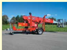
20030 - DENKA DK18 18m - Battery - year 2021