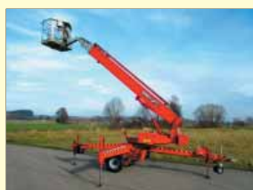
1482 - DENKA DK3 MK25 25m - Battery - year 1995