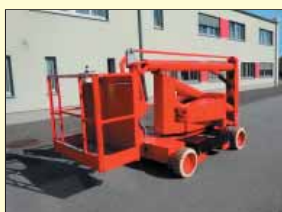
3104 - PB Dino 1120 11,2m - Battery - year 2000