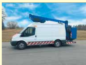
17954 - GSR E140TJV 13,5m - Ford Transit - 2013