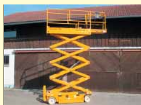
18809 - Haulotte Compact10N 10m - Battery - various years